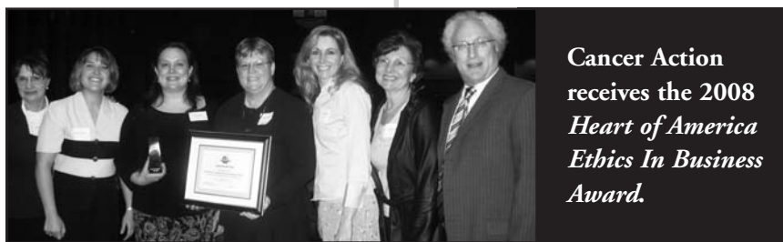
Cancer Action receives the 2008 Heart of America Ethics In Business Award.

2008 can be described as a year of challenge, a year of change and a year of recognition. There were certainly many things to celebrate, even during this difficult economic time.